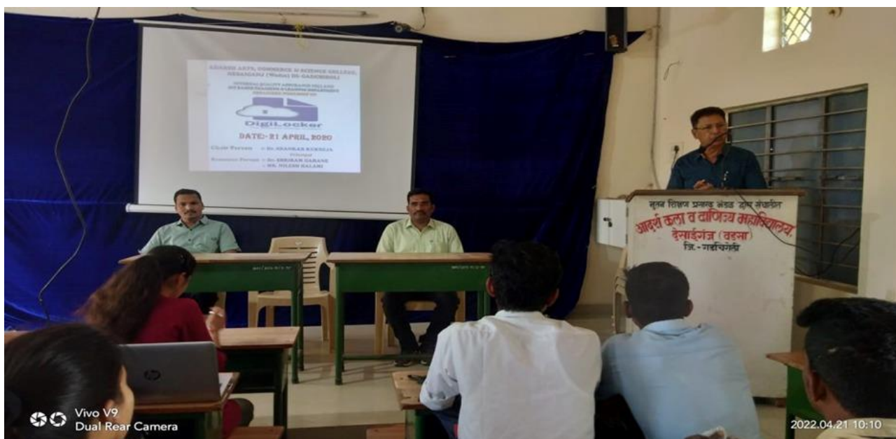
Workshop on Digi Locker Programme: 21.4.2022