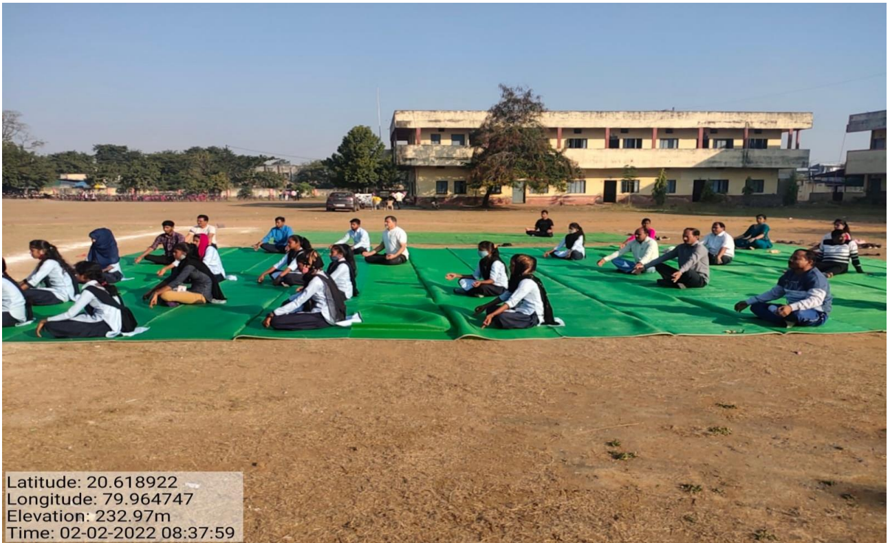
Weekly Celebration of Suryanamaskar: 2-2-2022